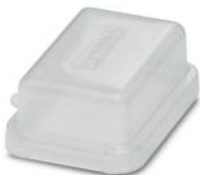
Protective covers, type: B6, degree of protection: IP20, color: transparent/white

Please be informed that the data shown in this PDF Document is generated from our Online Catalog. Please find the complete data in the user's documentation. Our General Terms of Use for Downloads are valid ( http://phoenixcontact.com/download )