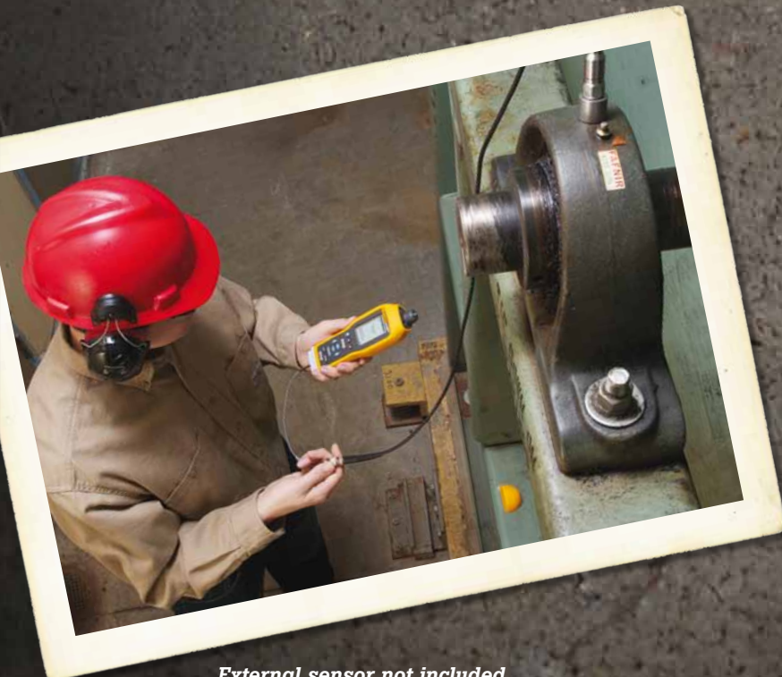
External sensor not included

Fluke. The Most Trusted Tools in the World.